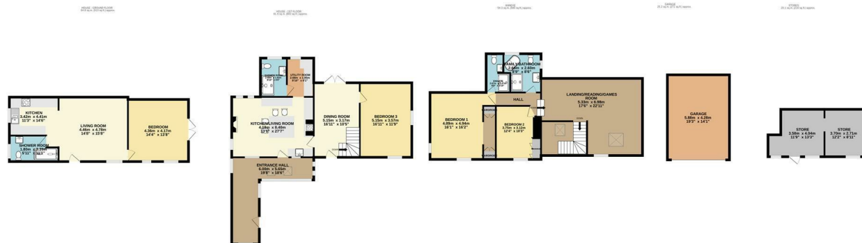
TOTAL FLOOR AREA : 266.4 sq.m. (2867 sq.ft.) approx. Whilst every attempt has been made to ensure the accuracy of the floorplan contained here, measurements of doors, windows, rooms and any other items are approximate and no responsibility is taken for any error, omission or mis-statement. This plan is for illustrative purposes only and should be used as such by any prospective purchaser. The services, systems and appliances shown have not been tested and no guarantee as to their operability or efficiency can be given. Made with Metropix ©2025